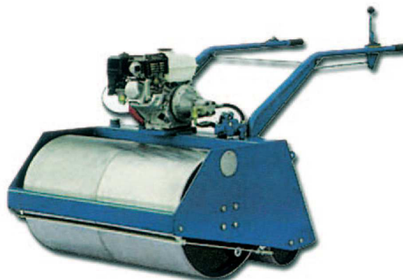
ZAGRO power roller

Length 70 Cm - Height 50 Cm Diameter 50 Cm - Thickness 6 mm Max weight with water filling: 180 Kg