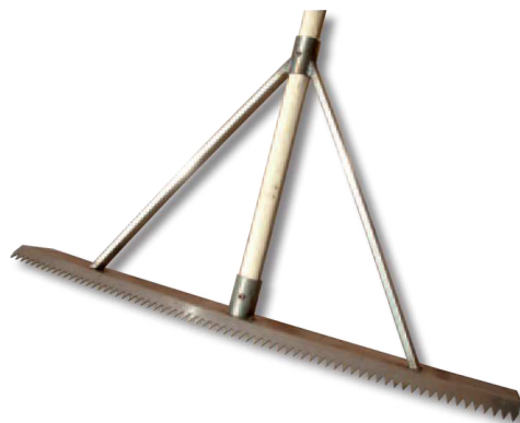
Stainless steel float

10 cm diameter - Complete with shut-off valve and hose connector with 22/25 mm diameter