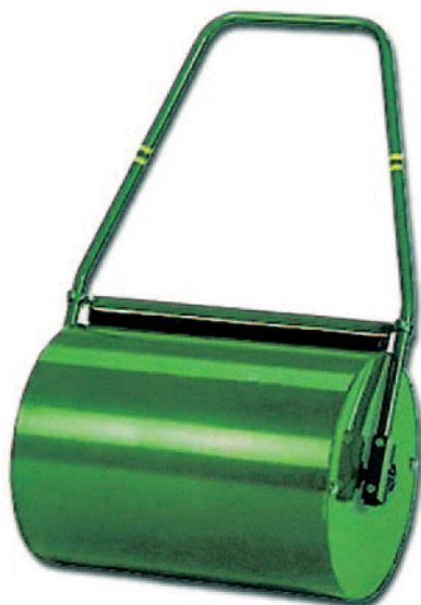
Manually operated iron roller with brush Drum

Very strong with reinforced edges and studs. Density: 90% Dimensions: 18 x 2m - 18x1,5m