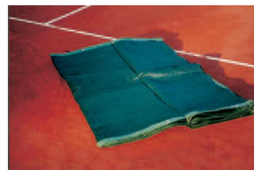
Court bottom tarpaulins

Very strong with reinforced edges and studs. Density: 90% Dimensions: 18 x 2m - 18x1,5m