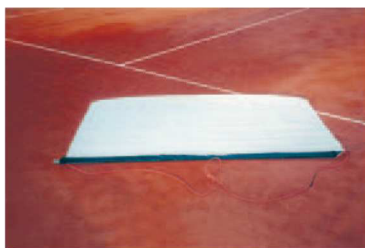
Coconut fibre levelling mat 2 x 1,5m